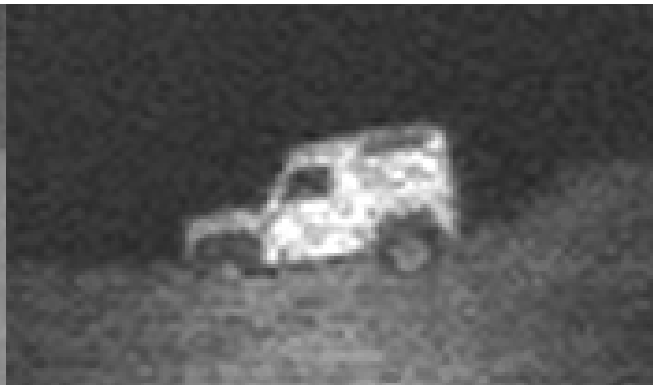
Swan II Dual-Mode Detector