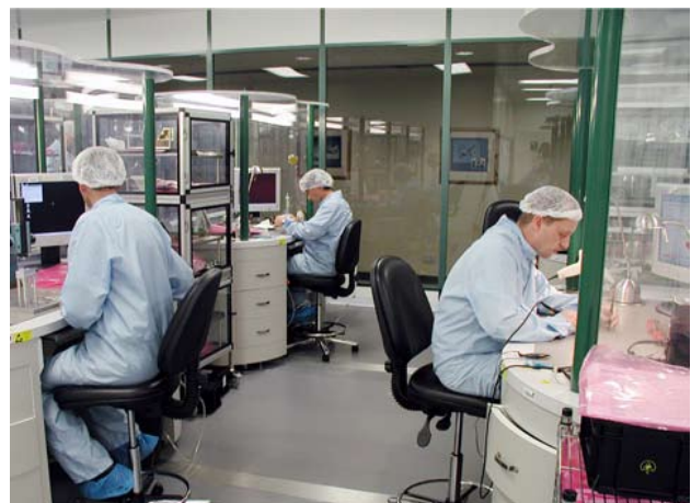
The MLRD capitalises on the substantial investment we have made in expertise and facilities

Our Company has a reputation for providing customers with the best in high performance and cost-effective technology for laser requirements. More than 4,500 laser have been produced and supported for over 25 countries - with integration complete on some 40 platforms across air, land and sea. We are currently under contract to develop the next generation of laser technology within the F-35 Joint Strike Fighter electro-optic targeting system.