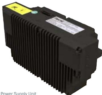
Power Supply Unit