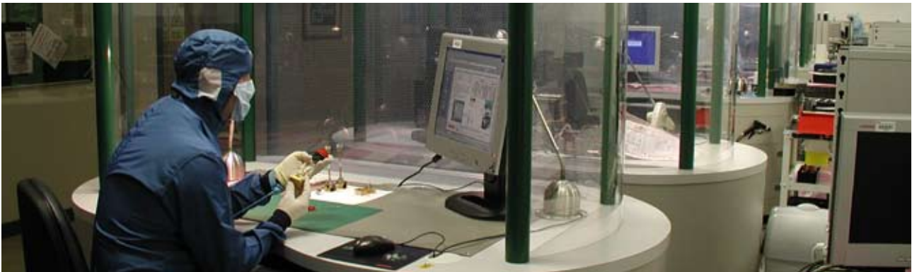
Laser centre of excellence