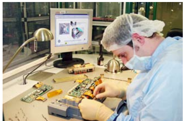
High Energy Laser Rangefinder / Designator in build

We are currently under contract to develop the next generation of laser technology within the F-35 Joint Strike Fighter electro-optic targeting system.