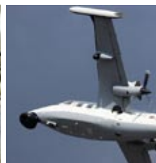
Piaggio P166 aircraft