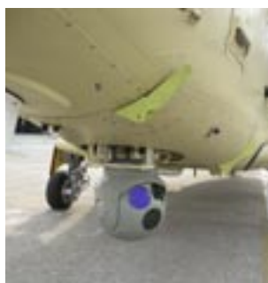
AW109 Power helicopter

Power Consumption: 150 W (Typical); 400 W (max) at 28 VDC