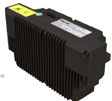
Power Supply Unit