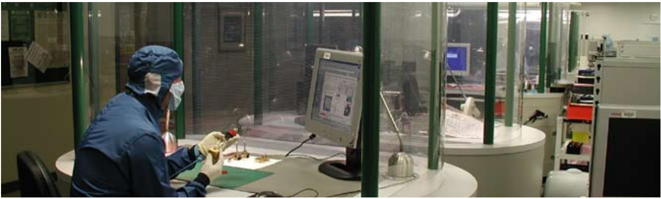
Laser Centre of Excellence